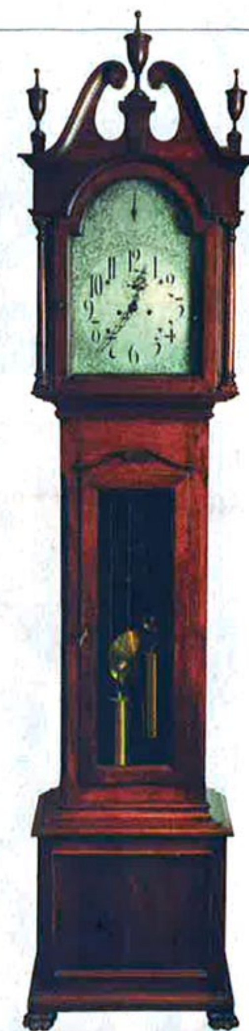
▲ Mahogany clock, $7,500. Grandfather clocks were common in colonial revival interiors. This Chippendale style with a silver dial is in original condition and dates from the late 1800s. www.stanleyweiss.com