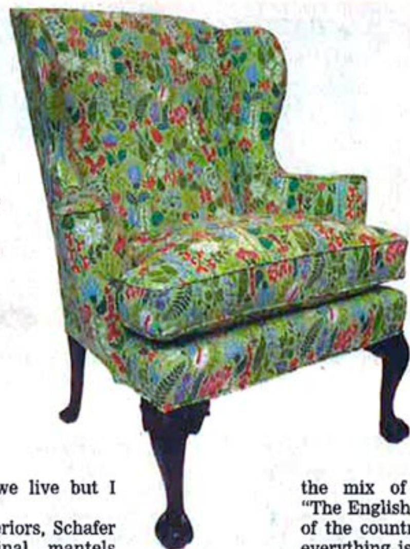
▲ Colonial revival chair, $2,850. This wing chair with carved mahogany legs dates from the 1920s, at around the time when the colonial style experienced its second revival. www.stevensclaroff.com