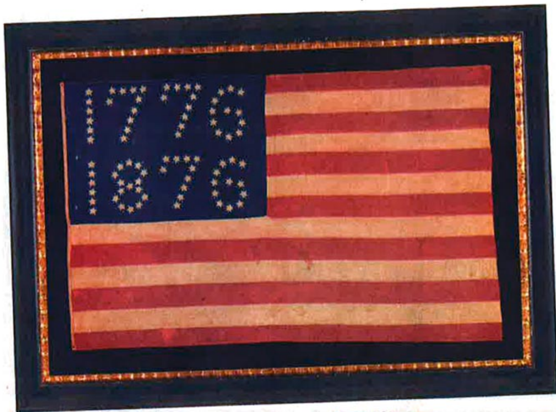
◀ Centennial Flag, $25,000. The US centennial celebrations resulted in various patriotic flag creations. Among the rarest are flags like this, with stars that spell out numbers or words. Only three other designs are known to exist. www.jeffbridgman.com