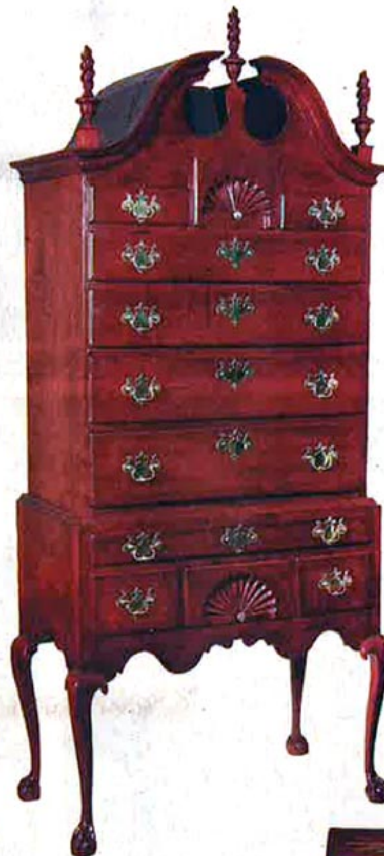
◀ Chippendale Highboy, $85,000. This walnut dresser dates from the end of the colonial period. The claw-and-ball feet were a typical feature when the colonial style was revived. www.stanleyweiss.com