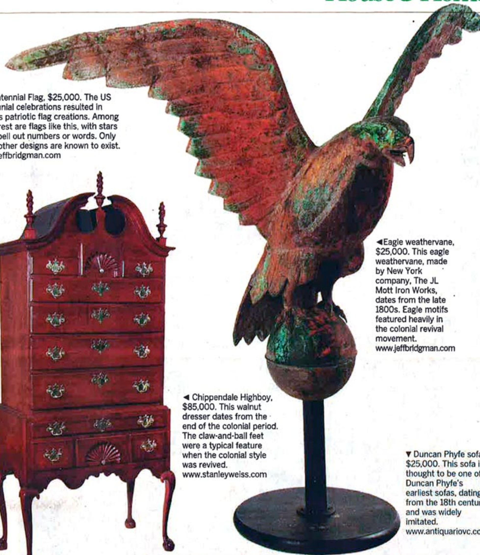
◀ Eagle weathervane, $25,000. This eagle weathervane, made by New York company, The JL Mott Iron Works, dates from the late 1800s. Eagle motifs featured heavily in the colonial revival movement. www.jeffbridgman.com