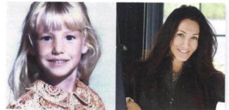
Windsor Smith Windsor Smith Home

Don't worry about what others think; do what makes you happy.